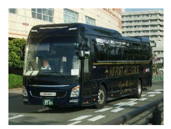
Airport Limousine Bus

Subway: Take the Fukuoka City Subway, getting off at Tojinmachi Station. The hotel is a 7-minute by taxi from the station. Approximately 15 minute subway ride from the airport.