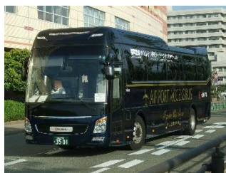
Airport Limousine Bus

Approximately 15 minute subway ride from the airport.