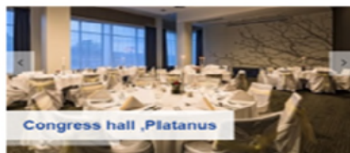
Congress hall ,Platanus