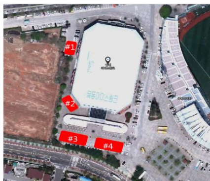
Tent Set up Plan Sector 1: Warming Up Area / Skating Lounge Sector 2: Press Center, Press Interview and Draw Sector 3: Accreditation Center / TV Office Sector 4: Staff Restaurant / Small medal ceremony

Period of operation: January 30, 2020 ~ February 9, 2020