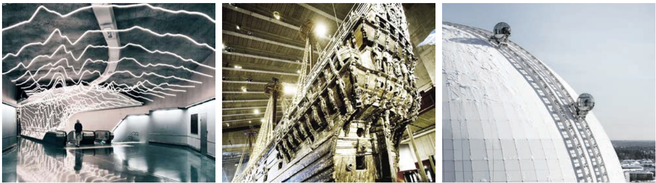
From left: subway art, the mighty Vasa ship and thrilling Ericsson Globe SkyView.