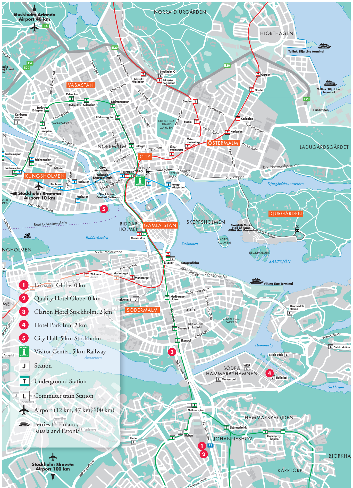
Map of Stockholm