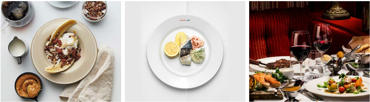
From left: breakfast all day at Pom och Flora, classic seafood at Sturehof and a bit of France at Brasserie le Rouge.