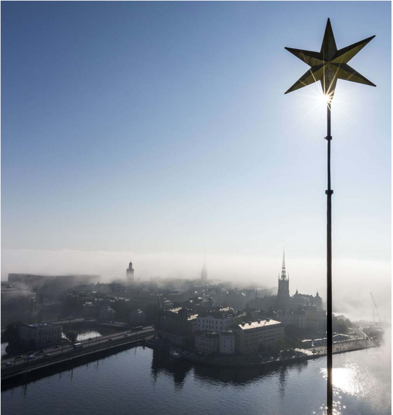
Spectacular view at Riddarholmen from the City Hall tower at 106 meters up.

The Closing Dinner will be held on Sunday, March 28, 2020, at 20:00 at the Stockholm City Hall, where the great Nobel Banquet is held every year. Dress is semi-formal. Invitations for the Closing Dinner will be issued to entitled persons in accordance with the given guidelines at the time of registration. Please note that the Closing Dinner may be cancelled due to Covid-19 restrictions.