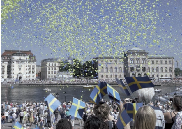
Swedish National Day, June 6th celebration outside the Royal Palace facing the National Museum.