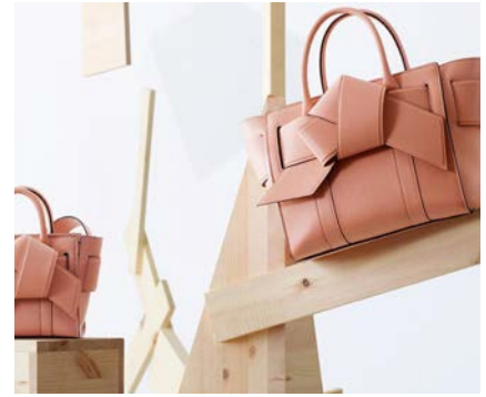
From left: high end brands at NK department store, beautiful Josef Franks textile at Svenskt Tenn and swedish Acne Studios collaboration with Mulberry.