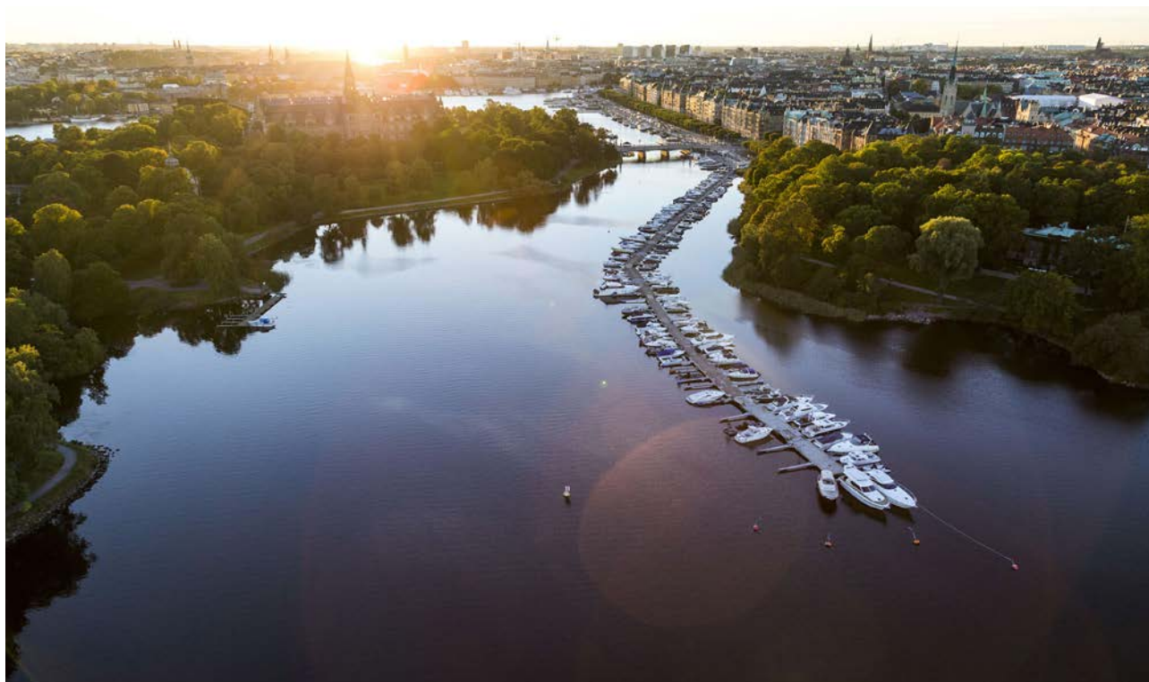
Beautiful Djurgården and Östermalm with Strandvägen from above.

Accreditation for all ISU Event Officials, ISU Office Holders, ISU Guests, Judges and Team Members will be issued at the official hotel – The Quality Hotel Globe and for Media at the Ericsson Globe Arena.