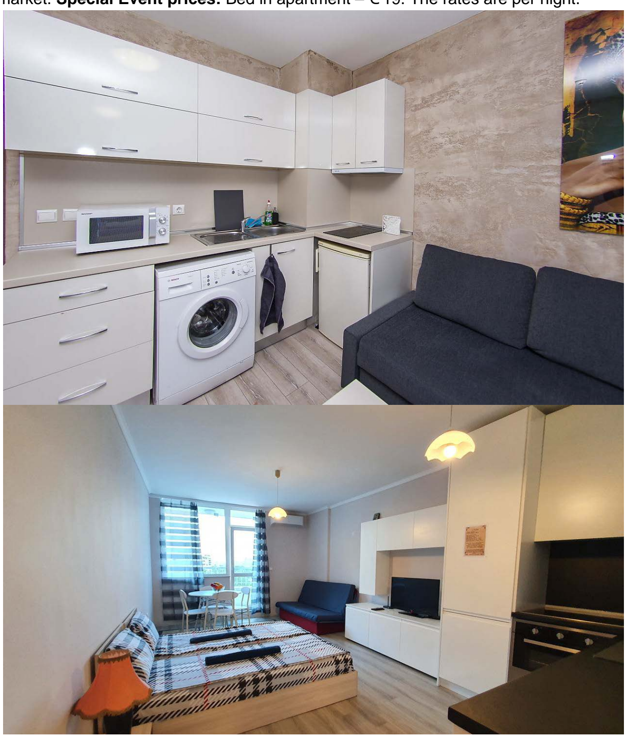
The room reservations for all team members must be done through the Organizing Committee in order to be provided the special room rates

APARTMENTS for rent, next to the Winter Sports Palace – Academician Boris Stefanov Str., Sofia. The apartments are for 2, 3 and 4 people. They have a separate kitchen, refrigerator, washing machine, air conditioning, internet, cable / satellite TV. The building has a 24-hour supermarket. Special Event prices: Bed in apartment – € 19. The rates are per night.