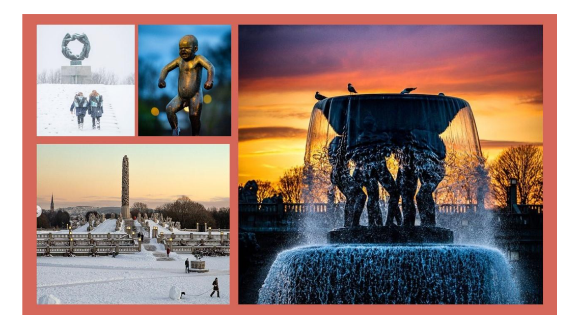
Vigeland Sculpture Park

Nature enthusiasts will be captivated by the numerous parks and green spaces scattered throughout the city. Vigeland Park, adorned with over 200 striking sculptures by Gustav Vigeland, is a testament to human emotion and connection.