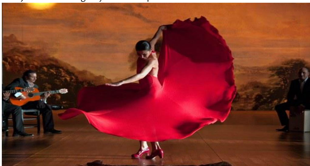
Flamenco in Granada.

If you want visit the Alhambra the tickets must be purchased in advance (attached form for reservations) official travel agency Autumn Cup.