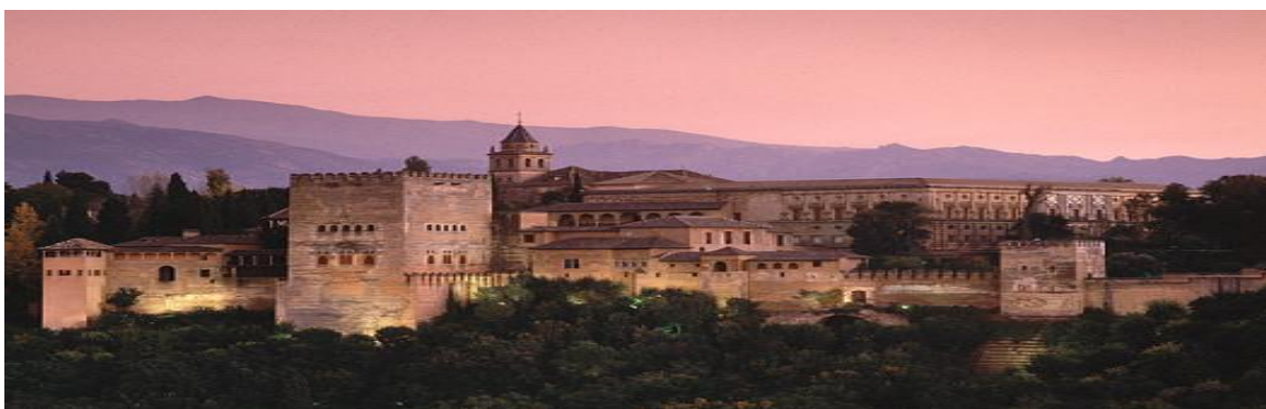
Alhambra of Granada

This guide provides important information you will need as your prepare your trip to the host city Granada.