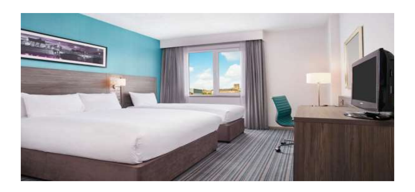
Jury's Inn Image 2 (from website)