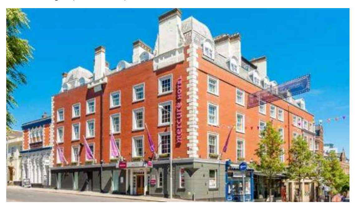
Mercure Image 2 (from website)