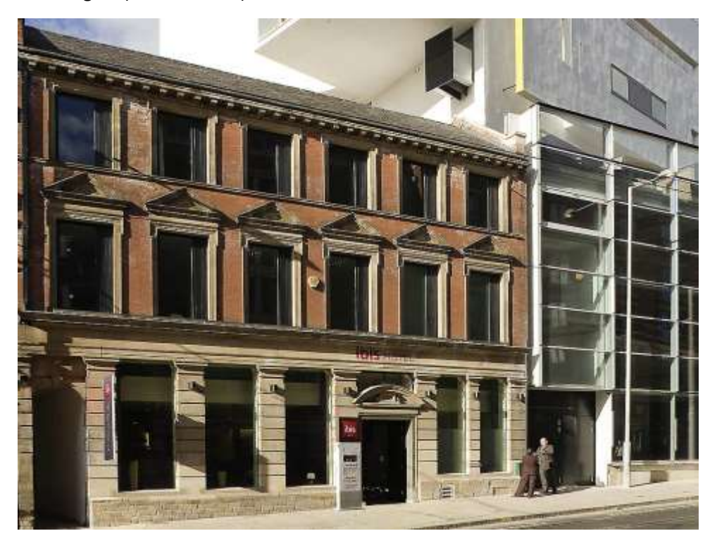
Ibis Image 2