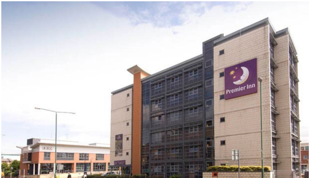
Premier Inn Image 2 (from website)