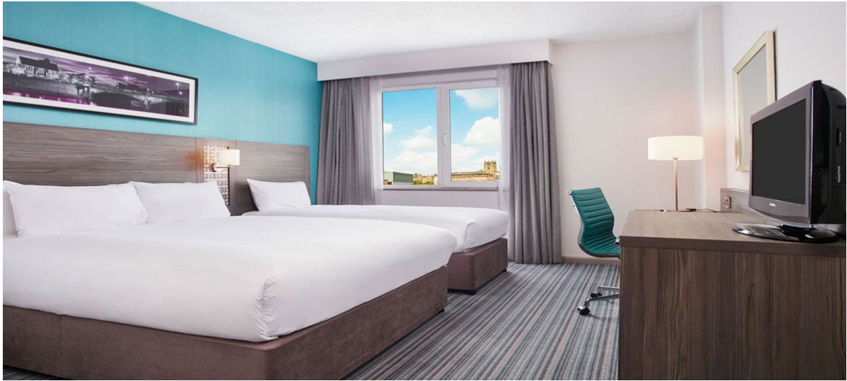
Jury's Inn Image 2 (from website)